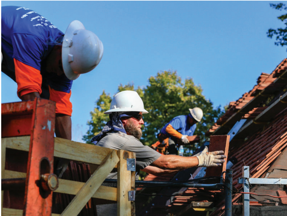
Construction workers lay tiles on the roof of a house in Boys Town, Neb.